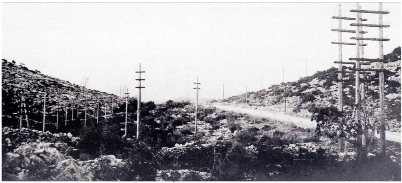
Fig. 3. Power line poles to Šibenik in phase of construction (taken from [9])

Manojlovac hydro plant. The 30 kV nominal voltage was the highest generator voltage in Europe, and remained such until 1947 when standard generator output voltages were reduced to 6 kV. Since the generators were directly connected to the power line, atmospheric discharges freqently caused generator coils to fuse. Replacing generator coils thus became a usual operating procedure. Since there were no circuit breakers synchronizing generators was not possible. Keeping an equal number of rotations between generators was done by the operator which used just his hearing to compare and equalize sound pitch coming from respective generators.