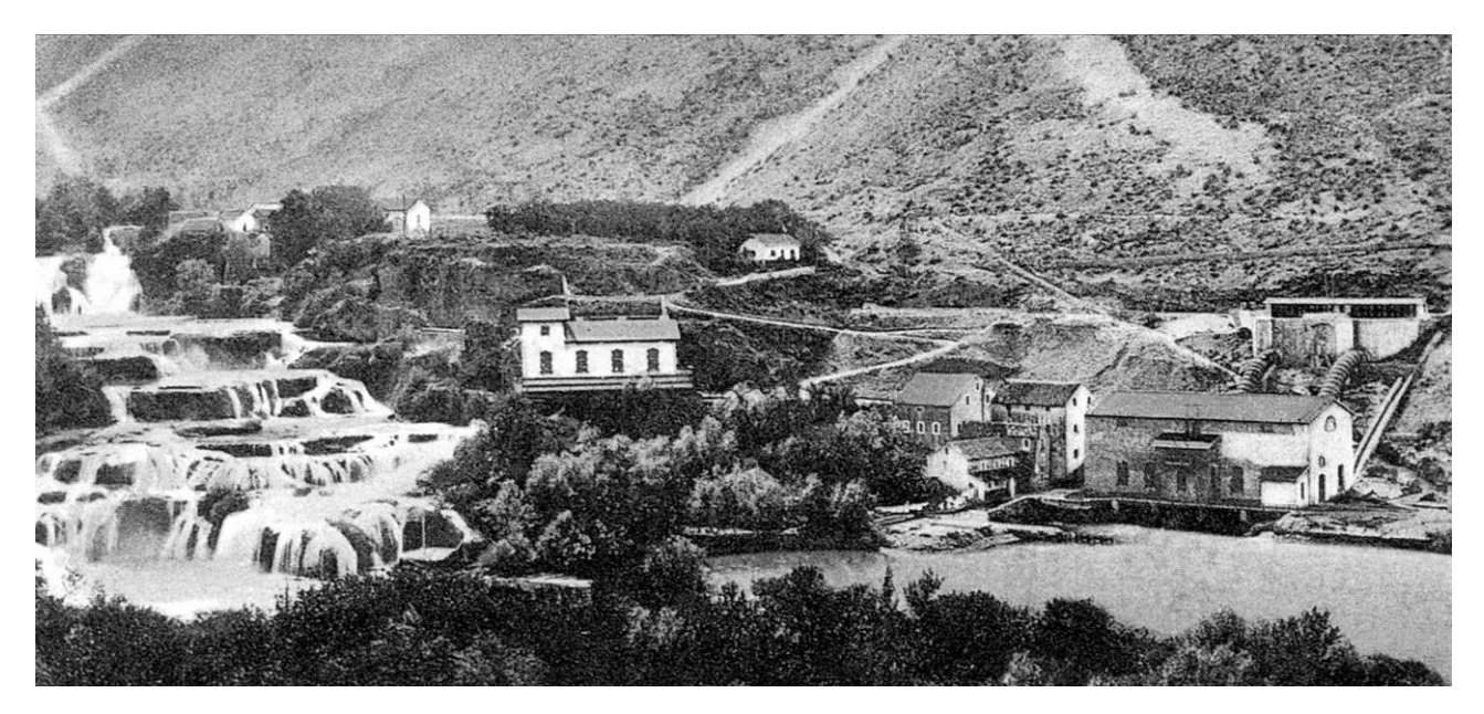
Fig. 4. Hydro plant Jaruga 1 in 1094 (taken from [12])

transmission line was the same. The system operated in the same manner for the following 40 years.